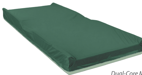
Dual-Core Mattress w/Defined Perimeter Edge

Sizewise Quick-Ship options provide facilities a cost-effective way to quickly increase patient capacity. The Dual-Core Mattress features two layers of foam for comfort and pressure redistribution. Polycarbonate 4-Way Stretch Top Cover fabric reduces friction and shear while standing up to rigorous hospital cleaning protocols. Optional defined perimeter edge provides additional support. Fire barrier meets CFR1633.