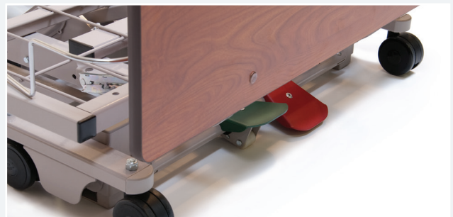
[02] INTUITIVE TWO-PEDAL LOCKING SYSTEM Centrally positioned and easily visible from a distance to ensure bed is locked